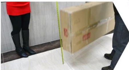
Drop Test Drop test at international standard