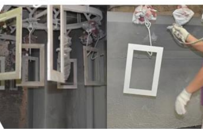
Assembly of finished product Manual assembly of SUB-Parts and hardware accessories