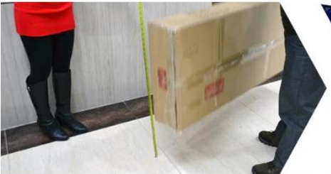
Drop Test Drop test at international standard