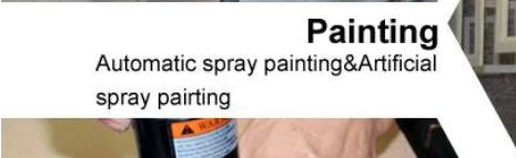
Painting Automatic spray painting&Artificial spray pairting