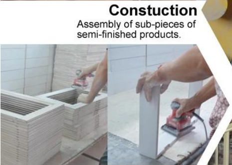
Constuction Assembly of sub-pieces of semi-finished products.