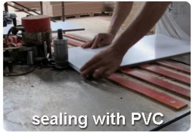
sealing with PVC