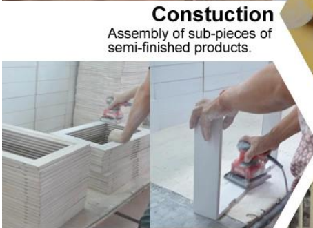
Constuction Assembly of sub-pieces of semi-finished products.