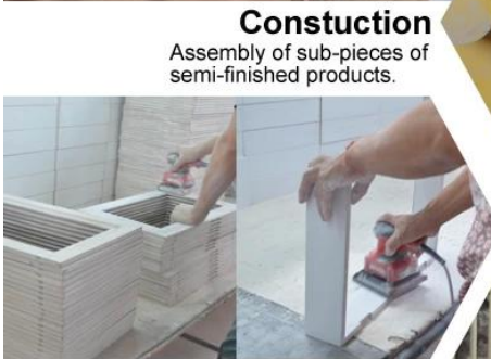
Constuction Assembly of sub-pieces of semi-finished products.