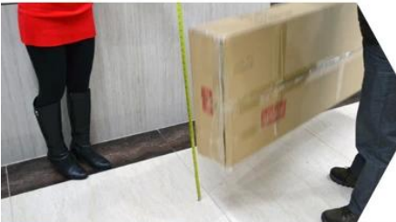
Drop Test Drop test at international standard