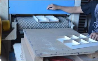
Hand sanded 3 times Sanding polishing