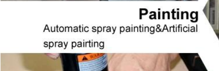
Painting Automatic spray painting&Artificial spray pairting