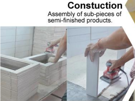
Constuction Assembly of sub-pieces of semi-finished products.