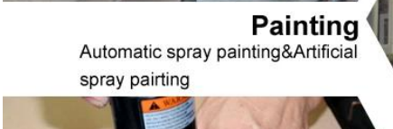
Painting Automatic spray painting&Artificial spray pairting