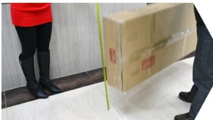
Drop Test Drop test at international standard