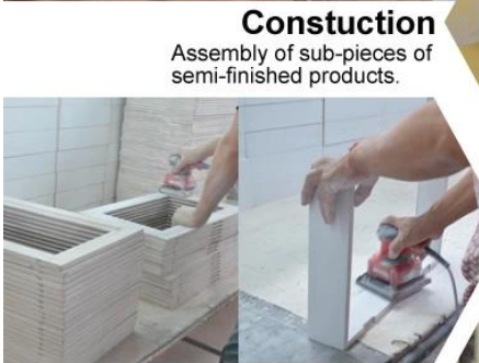
Constuction Assembly of sub-pieces of semi-finished products.