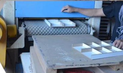
Hand sanded 3 times Sanding polishing