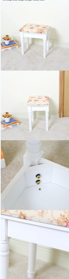
Dressing room Simple design Vanity Stool