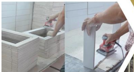
Hand sanded 3 times Sanding polishing

Assembly of sub-pieces of semi-finished products.