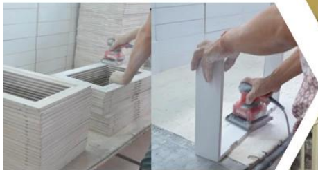
Hand sanded 3 times Sanding polishing

Assembly of sub-pieces of semi-finished products.