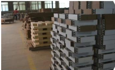
Hand painting 3 times