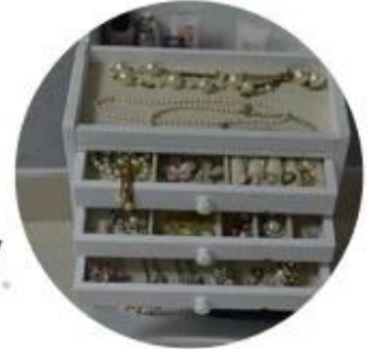
drawers for jewelry