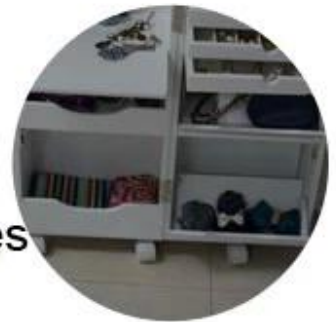
shelves for accessories