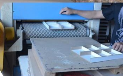
Hand sanded 3 times Sanding polishing