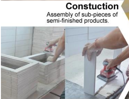
Constuction Assembly of sub-pieces of semi-finished products.