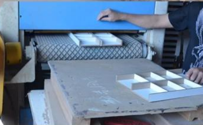
Hand sanded 3 times Sanding polishing