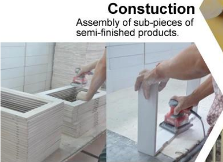
Constuction Assembly of sub-pieces of semi-finished products.