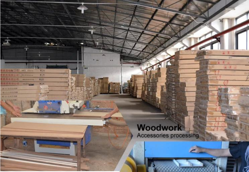
Woodwork Accessories processing