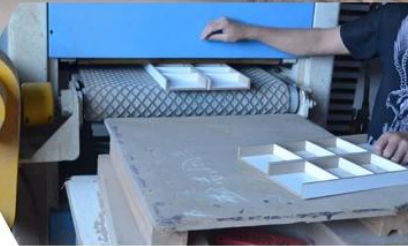
Hand sanded 3 times Sanding polishing