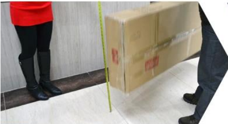
Drop Test Drop test at international standard